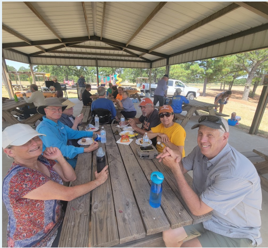
Circle D Neighbors enjoying great company and good food.